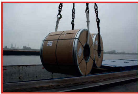
EXTREEMA® STEEL COIL LIFTING SLINGS MBL 280T