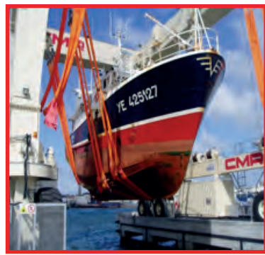
HEAVY LIFT BOAT LIFTING SLINGS MBL 2240T