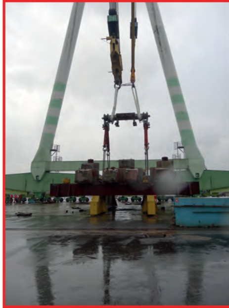
HEAVY LOAD TEST with EXTREEMA® SLINGS MBL 1890T