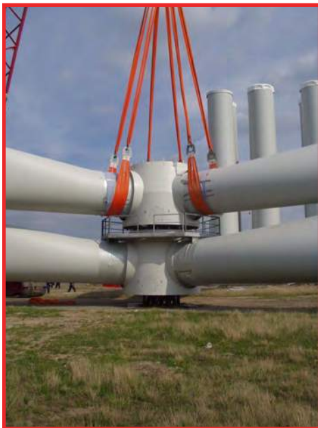
EXTREEMA® BLADE & HEAVY LIFT MBL 840T