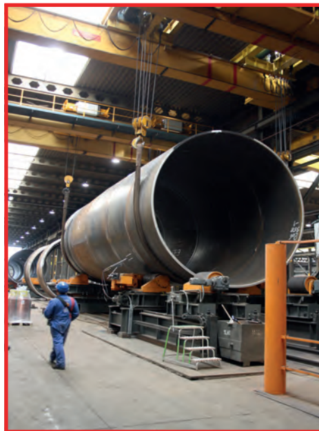
MONOPILE & FOUNDATION LIFTING SLINGS 940T