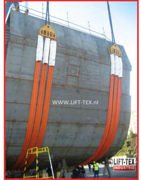
EXTREEMA® MARITIME SLING OPERATIONS 640T