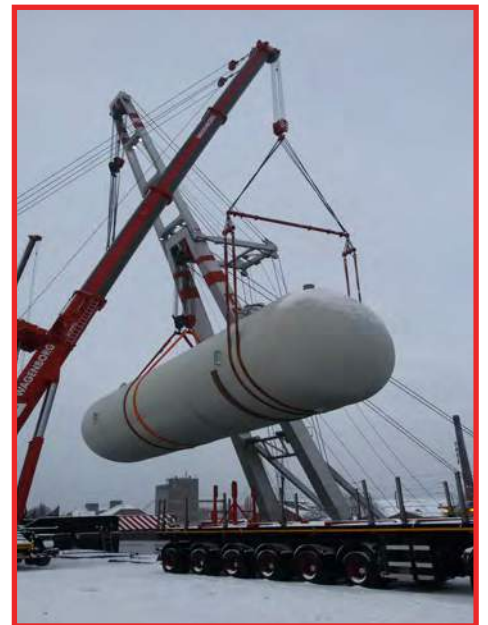
TRANSPORTATION PRESSURE VESSEL 360T